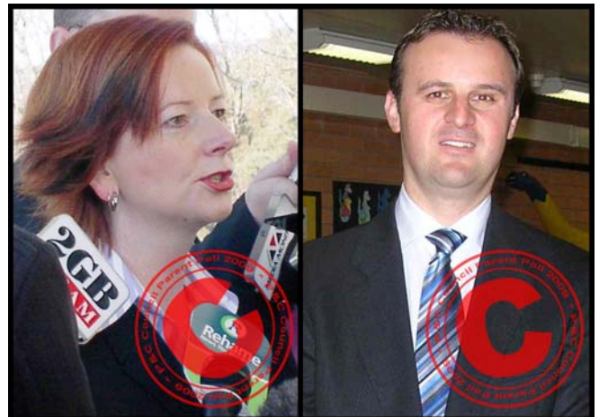
Commonwealth Education Minister Julia Gillard (l) and ACT Minister for Education Andrew Barr (r)

"Despite the Federal Government's claim that it's on the right track in relation to education, parents expect a high standard of appropriately